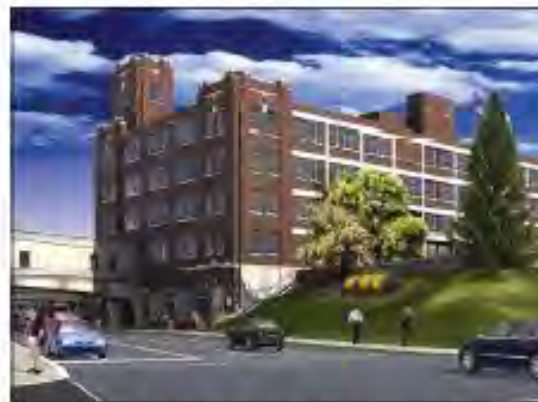
TK Budd Facility Redevelopment Revitalization